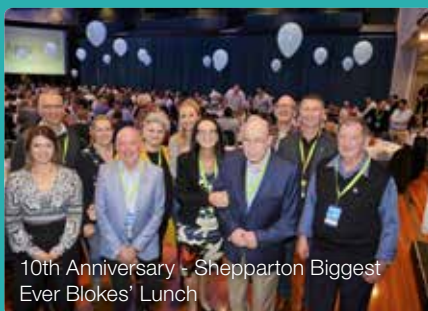
10th Anniversary - Shepparton Biggest Ever Blokes' Lunch

Biggest Ever Blokes' Lunches continued to expand across the country and raised over $1.3 million. New events, with the help of Apex Australia, were held in Brisbane, Noosa, Newcastle, the Gympie Music Muster, Brisbane Valley, Wodonga and Ulverstone, with even more planned next year.