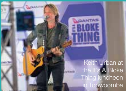
Keith Urban at the It's A Bloke Thing luncheon in Toowoomba

It's a Bloke Thing Foundation raised the bar even higher, with international country music legend Keith Urban a surprise guest at its Toowoomba luncheon. Now in its eighth year, the event partnered with PCFA and raised over $2 million as they expanded their luncheons to include Darwin and Gold Coast, with more to come.