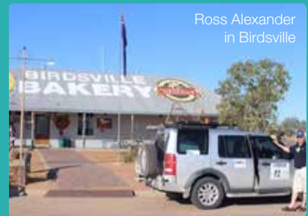
Ross Alexander in Birdsville

The inaugural Outback 4WD Adventure attracted almost 40 cars, which travelled to Broken Hill across the Simpson Desert to raise $200,000 for prostate cancer research.