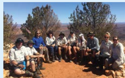
Our intrepid trekkers on the Larapinta Trail

In early May we partnered with adventure specialist, Aurora Adventures to create a wilderness trekking challenge on the Larapinta trail in Central Australia.