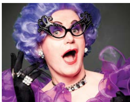
Dame Edna Average entertained the Friday Long Lunchers