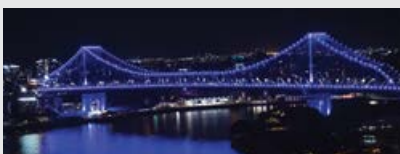
The Storey Bridge lit blue for Men's Health Week

Over Easter a group of intrepid riders took to the road on 110cc postie bikes for an epic ride from the Gold Coast to Uluru. Travelling on mostly dirt roads and battling flooded roads and flies, the riders raised almost $20,000 with donations still coming in.