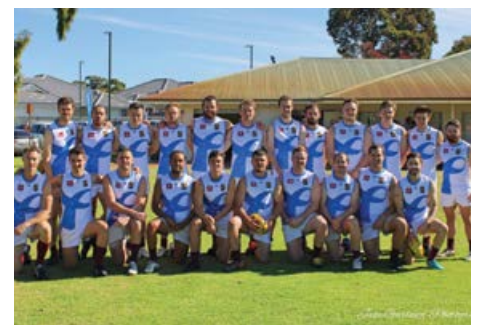
Carlisle Football Club supporting prostate cancer