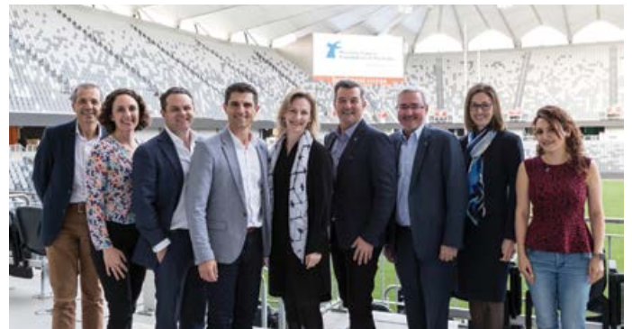
Biggest Ever Blokes' Lunch Western Sydney at the Bankwest Stadium

The brand new Bankwest Stadium in Parramatta played host to the inaugural Biggest Ever Blokes' Lunch in Western Sydney on Friday June 14th. Over 250 movers and shakers enjoyed the fabulous backdrop of Bankwest Stadium as they listened to a wonderful ensemble of speakers opening up the conversation about prostate cancer during Men's Health Week.