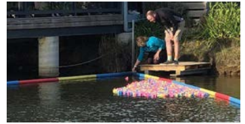
Puddleduck Dunk 2019 Duck Race Finish Line