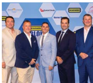
It's a Bloke Thing Gold Coast