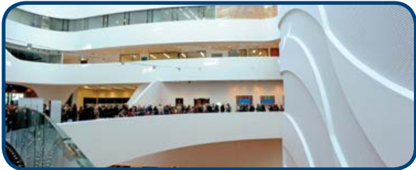
Community Conversations 2018 – Attendees gather outside the theatre at the stunning Peter MacCallum Cancer Centre