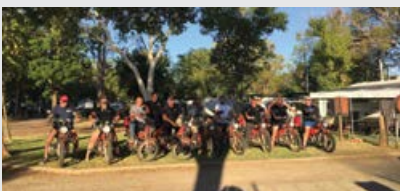
The Wild Dogs Postie Ride