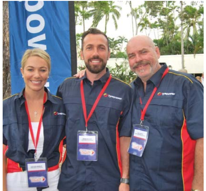
Participants at the 42nd Tyrepower International Conference