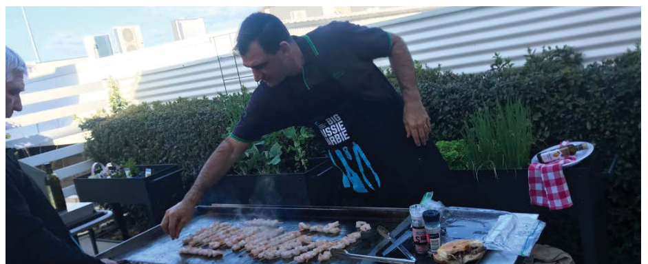
The team at GR Engineering Services cooking up a storm