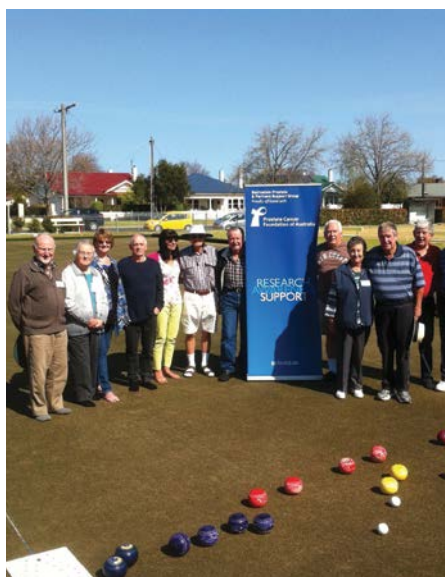
Members of Bairnsdale PCSG (VIC) at Bairnsdale Bowls Club during a monthly meeting