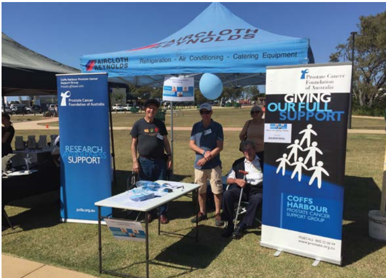
Members of Coffs Harbour PCSG (NSW) hosted an information stall at the local Harbourside Markets