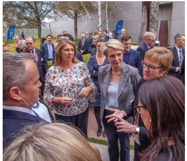
Connecting with Federal MPs at PCFA's 2018 Parliamentary Big Aussie Barbie