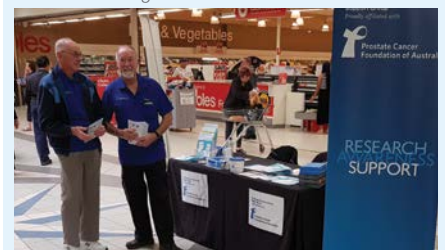
Members of Southsiders PCSG (WA) hosting an information stall at the local Forest Lakes Shopping Centre