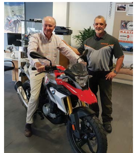
BMW Motorrad Presentation

2018 with $5 from each pair of pants sold donated to PCFA. Customers again responded strongly to cashiers' requests to "match" the GAZMAN donation, demonstrating the relevance of this successful campaign to customers.