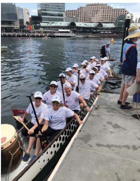
Members of the Nepean and Blue Mountains PCSG (NSW) participating in the Dragon Boat regatta at Sydney's Darling Harbour, proudly supported by PCFA