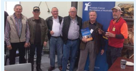
Members of Bairnsdale PCSG (VIC) at Lakes Entrance Men's Shed Event