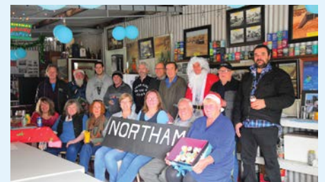
From top: Taking the plunge at Central Park Plunge; Croke Ave Retreat Social Club