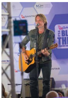
From top: Story Bridge goes blue for prostate cancer awareness month; Shag Islet Cruising Yacht Club Rendezvous; Keith Urban performs at It's a Bloke Thing Toowoomba