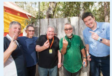
Country music legend John Williamson shared his own prostate cancer story at the Apex Gympie Muster Lunch