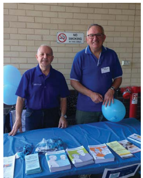
Members of Westmead PCSG (NSW) hosted an information stall at the Westmead Private Hospital IMed Radiology Big Aussie Barbie