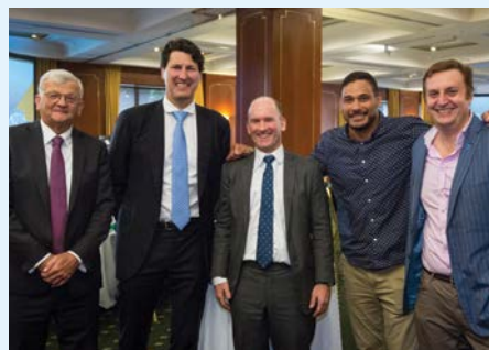
Rugby Union legend John Eales and Rugby League star Justin Hodges in Brisbane

Apex Australia continues to support the initiative as their national campaign and inaugural events have been held at Gympie Muster as well as Wodonga, Brisbane Valley (Esk) and Ulverstone, all of which have been fantastic successes. Plans are underway for other Apex groups to hold lunches over the coming months.