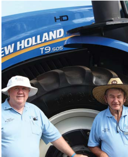
New Holland Field Day event