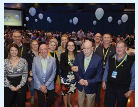
Shepparton Biggest Ever Blokes' Lunch Committee celebrating an incredible 10 years