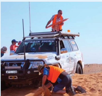
Drivers of the 2018 Outback 4WD Adventure digging out of the "Big Red" sand dune

You may not have heard of Trundle, located about 50km north west of Parkes, but in September the community put themselves firmly on the map with the first ever Trundle Testicle Festival. The group chose their name because it had a nice ring to it, and the $14,500 of funds raised were all donated to PCFA.