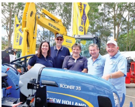
Members of the Nepean and Blue Mountains Prostate Cancer Support Group and New Holland Agriculture team at the Diesel, Dirt & Turf Expo in Penrith