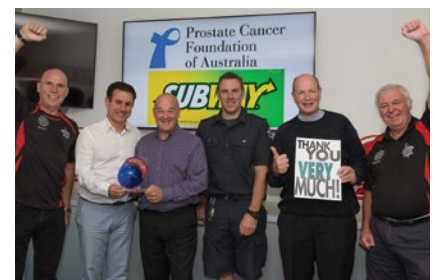
Mt Gambier Gold Cup