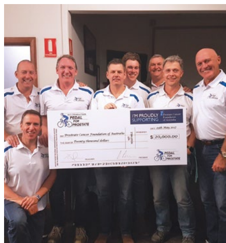
Pedal 4 Prostate cheque presentation

Our flagship "Biggest Ever Blokes Lunch" (BEBL) events kicked off in Bairnsdale this year which is supporting their local Prostate Cancer Specialist Nurse. The 2017 BEBL calendar is looking the best yet with many dates locked in!