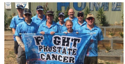
International Practical Shooting Confederation of Australia fights for prostate cancer

funds for PCFA. The IPSC has members as young as 12 years who wore blue Fight Prostate Cancer t-shirts raising awareness in their local community.