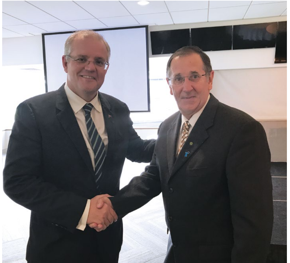
The Hon Jim Lloyd thanking the Treasurer, Hon Scott Morrison MP, for the additional $5.9 million funding for the Prostate Cancer Specialist Nursing Service as part of the Federal Budget 2017

Over the past five years the Prostate Cancer Specialist Nursing Service has truly moved from a pilot program to an established and integral part of the multi-disciplinary team caring for men and their families affected by prostate cancer.