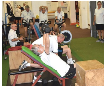
Prost! Exercise PCSG

Prost! Exercise Prostate Cancer Support Group has celebrated their 5 th anniversary. To date over 150 men have benefited from the group, which partners with the Subiaco Football Club in WA to utilise gym facilities twice a week.