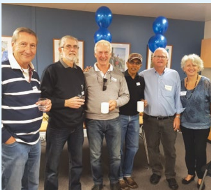
PCFA WA office hosting their Thank You Morning tea

PCFA's NSW and Victorian offices also held their respective thank you morning tea during National Volunteers' Week to recognise the work undertaken by volunteers to reduce the impact of prostate cancer in the community.