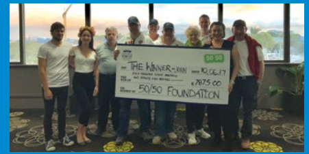
Queensland office representatives with PCFA volunteers

PCFA raised vital funds as well as awareness of prostate cancer to over 30,000 racegoers across 5 weekends. This opportunity was made possible through our new major partnership with UBET.