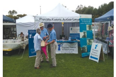
Prostate Cancer Action Group at a recent agricultural show

The Prostate Cancer Action Group (PCAG) in SA has been raising awareness at the recent Kingston, Penola and Angaston agricultural shows. The PCAG stall was busy at all functions, handing out PCFA brochures and talking to the community about prostate cancer.