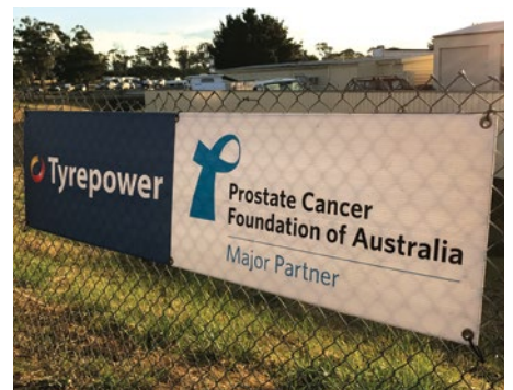
Tyrepower and PCFA partnership