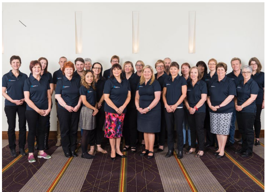
Prostate Cancer Specialist Nurses