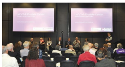
Panel discussion at the Let's Talk Prostate Cancer forum