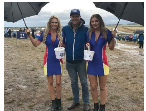
Tyrepower Tasmania Supersprint – Rain or shine, funds must be raised